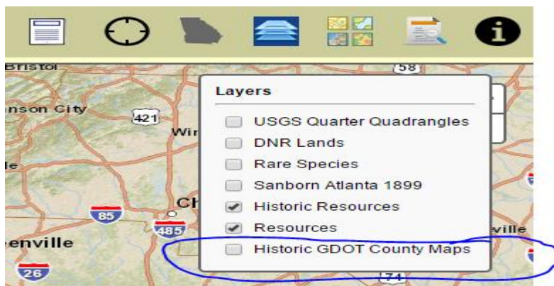
Figure 1: Public map main menu with layers menu icon activated and the Historic GDOT County Maps layer circled: